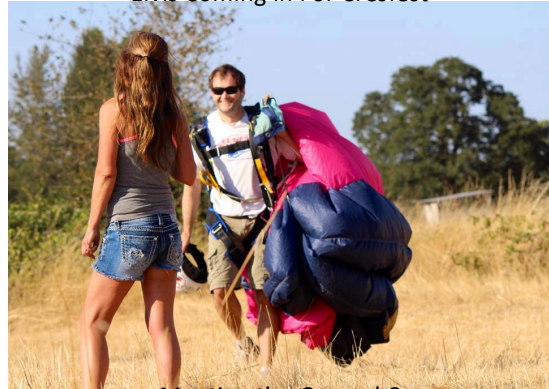
Meeting the Ground Crew