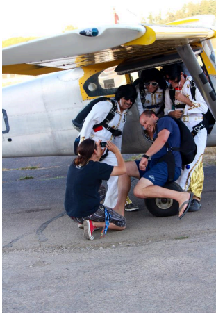
Pre-Demo Camera Fun